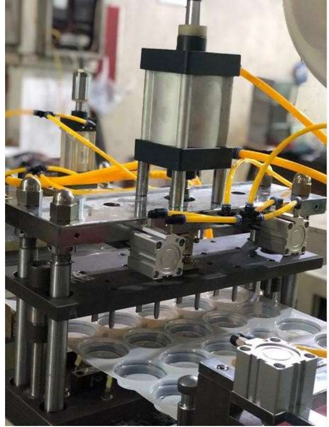
Forming Part Hole or Cross Punching Part